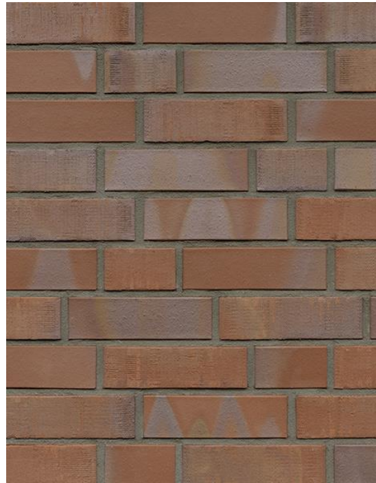
NF Halle Glatt FS mittel